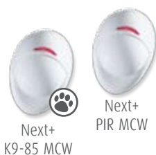
Next+ K9-85 MCW

Wireless, digital motion detectors with a pet-tolerant model for animals weighing up to 38kg (85lb) and a contemporary design that suits any décor